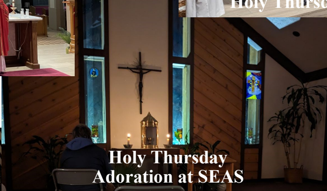
Holy Thursday Adoration at SEAS