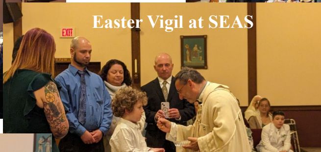
Easter Vigil at SEAS