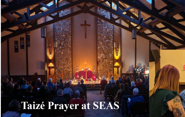
Taizé Prayer at SEAS