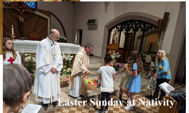
Easter Sunday at Nativity