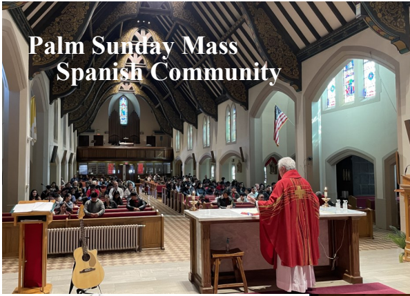
Palm Sunday Mass Spanish Community