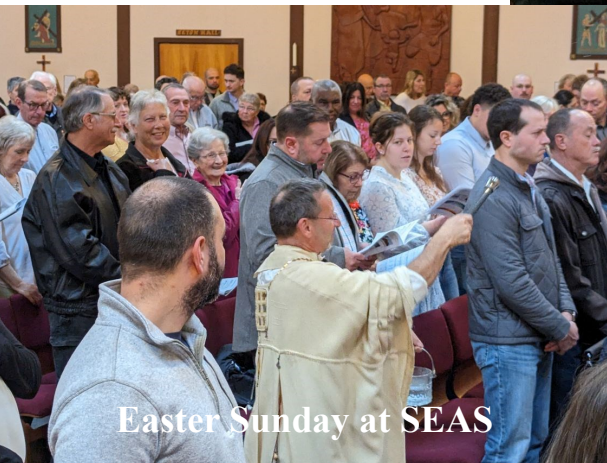
Easter Sunday at SEAS