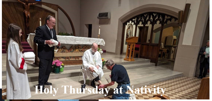
Holy Thursday at Nativity