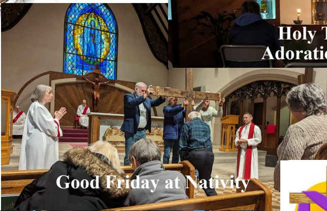
Good Friday at Nativity