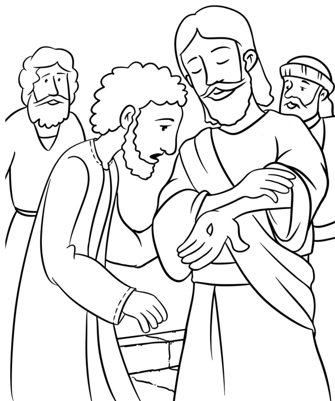
Thomas sees the wounds on Jesus' hand.